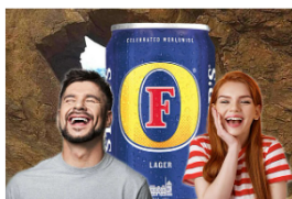
Loveland's Cool (And Odd?) Love Affair With a Lonely Can of Fosters Beer