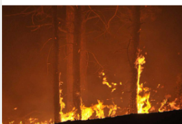
Not Cool: Fire Season and 14 of the Biggest Colorado Wildfires